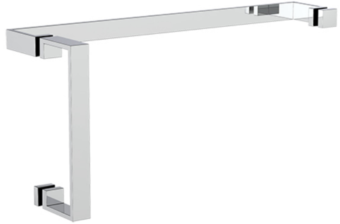
Offset Door Handle